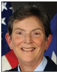
Gen. Ellen Pawlikowski