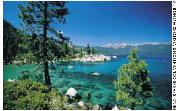
RENO-SPARKS CONVENTION & VISITORS AUTHORITY

Tour South Lake Tahoe in two and a half hours, exploring Heavenly Village and the Hard Rock Café. Visit the casinos or take a gondola ride to the top of Heavenly Ridge Ski Resort (gondola ticket not included). Visit historic buildings in Carson City, and experience the wild west in historic Virginia City for one and a half hours, with a walkabout tour, mine exploring or shopping. (Tour departs from Grand Sierra lobby, bus loading at 6:15 am)